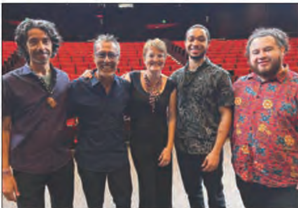
Downtown Tumbao: Sunday, 2-4pm