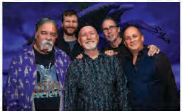
Fast Eddie and the Slowpokes