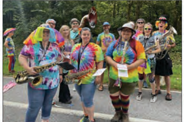
Greenbelt Honk! Situation, Sunday, noon-1:30pm