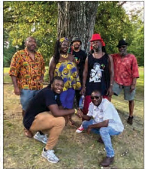
Proverbs Reggae: Saturday, 2-4:30pm