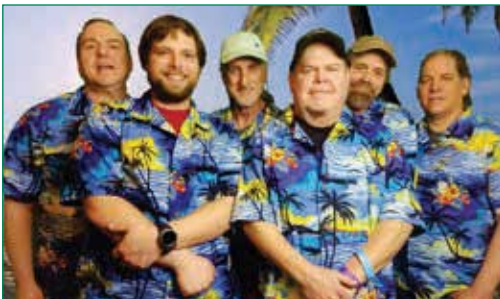
Back to the Beach: Saturday at noon