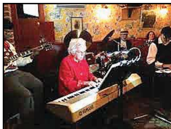
Granny and the Boys

6pm Various locations throughout the festival.