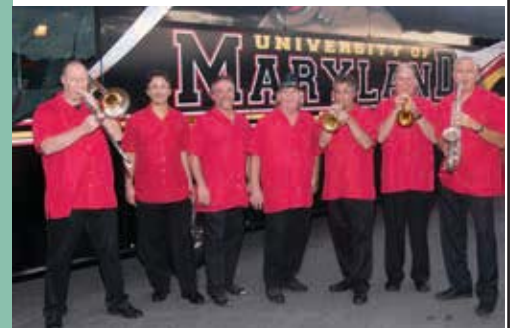
The Nowhere Men: Saturday at 8 pm

To receive updates on the Greenbelt Labor Day Festival, follow us on Facebook and Twitter.